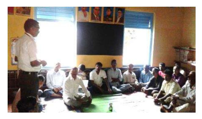
(P.O. Addressing the adopted villagers, about Cleanliness)